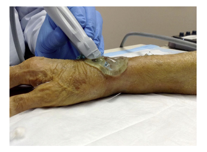
FIGURE 1: The ultrasound transducer is positioned parallel to the articular surface of the distal radius.