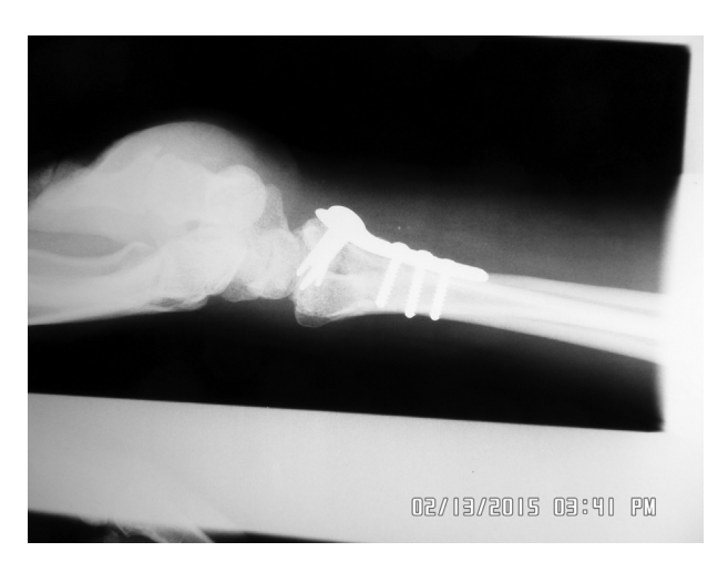
FIGURE 3: Plain radiographs suggest peg penetration into the wrist joint.