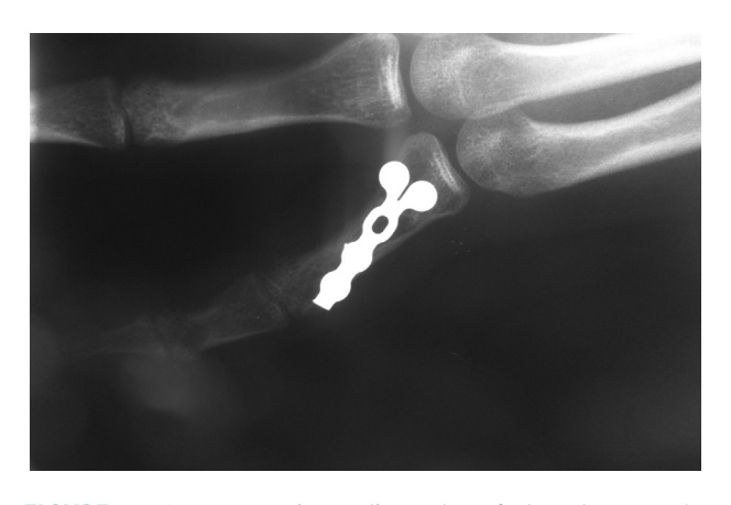
FIGURE 6: Anteroposterior radiographs of the plate on the proximal phalanx.

surgeon. Her complaint was continuing dorsal forearm pain. It is easy to identify the screw protruding out of the dorsal cortex. One can count the threads and see the hypoechoic inflammation about the screw. There is partial tendon erosion. Her symptoms rapidly resolved after removal of the screws and plate (Fig. 2).