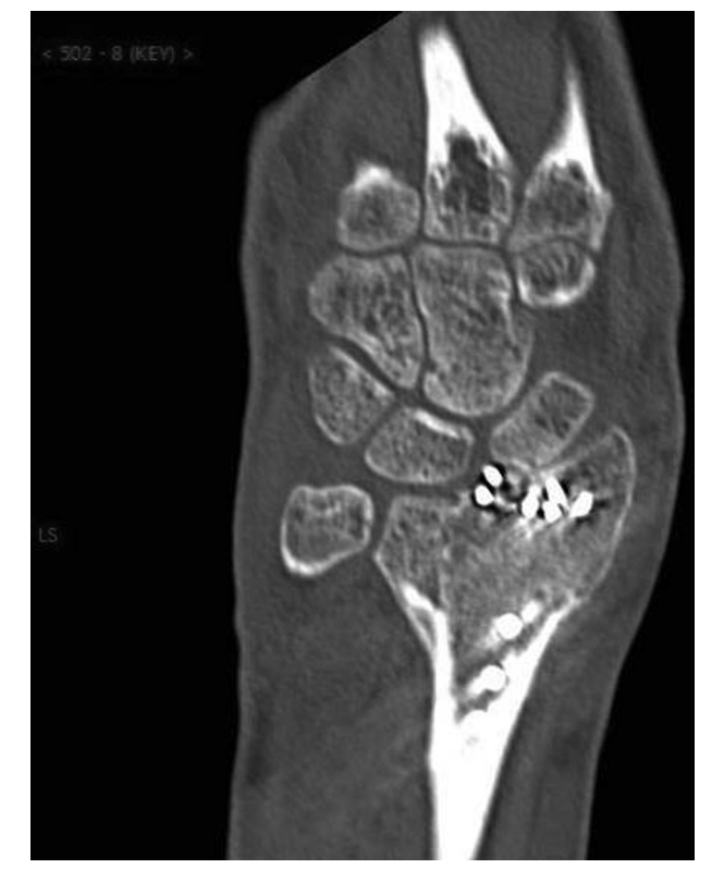
FIGURE 5: Computed tomography scan images documenting peg penetration into the wrist joint.