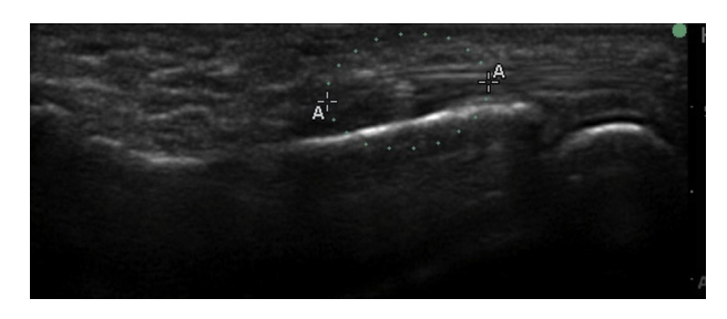
FIGURE 8: Ultrasound image demonstrating flexor tendon erosion about the penetrated screw tip.

does, and provided computed tomography images reinforce the point (Figs. 4, 5).