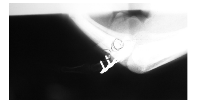
FIGURE 7: Lateral radiographs of the plate demonstrating the long screw tip.

The second case shows a threaded peg penetrated into the wrist joint. Plain radiographs did not clearly show that penetration (Fig. 3). Ultrasound, however,